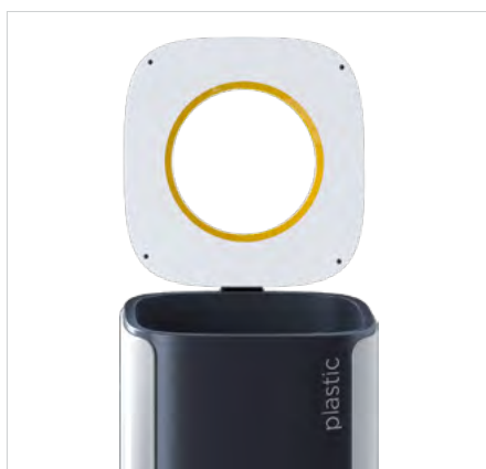
Quick and easy replacement of the bag.